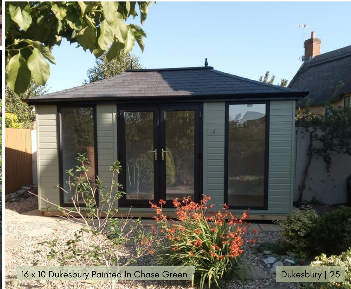
16 x 10 Dukesbury Painted In Chase Green