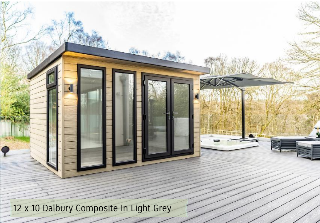
12 x 10 Dalbury Composite In Light Grey