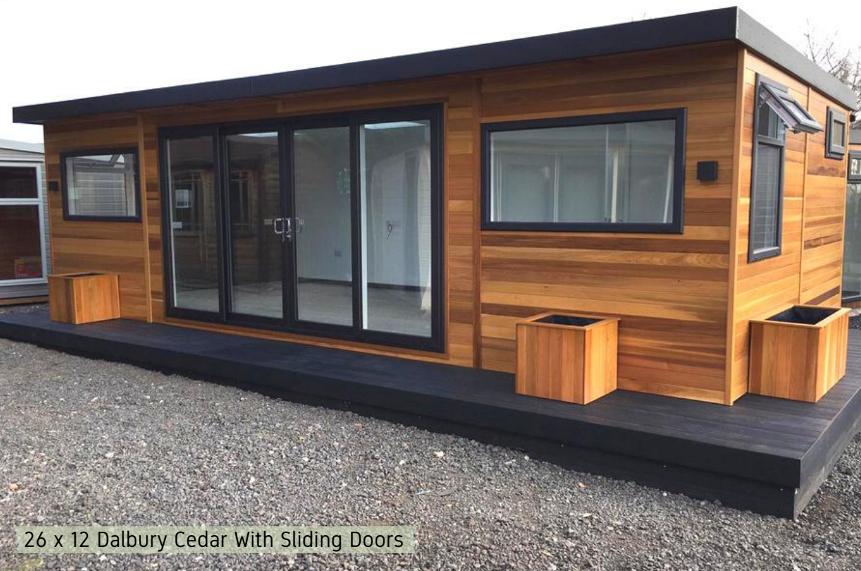
26 x 12 Dalbury Cedar With Sliding Doors