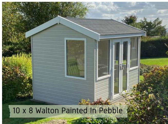
10 x 8 Walton Painted In Pebble