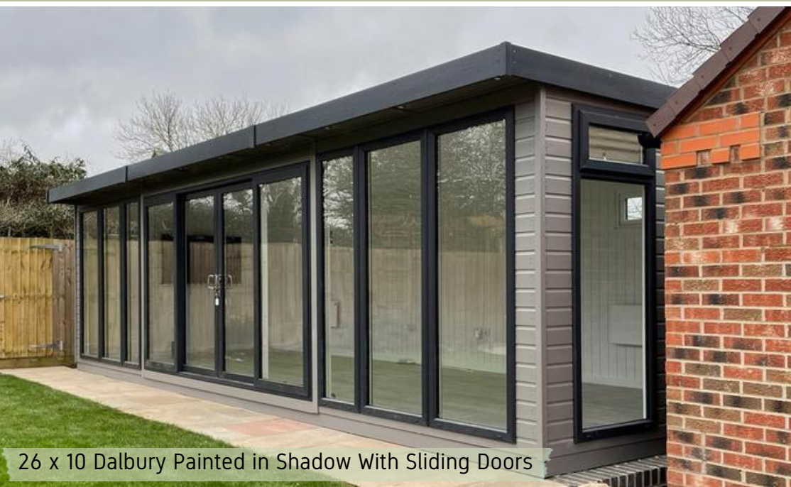
26 x 10 Dalbury Painted in Shadow With Sliding Doors

Our best-selling garden room The Dalbury is visually striking and stylish. The build is designed to add a contemporary look and feel to any outdoor space.