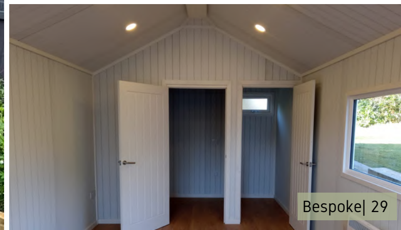
Bespoke | 29