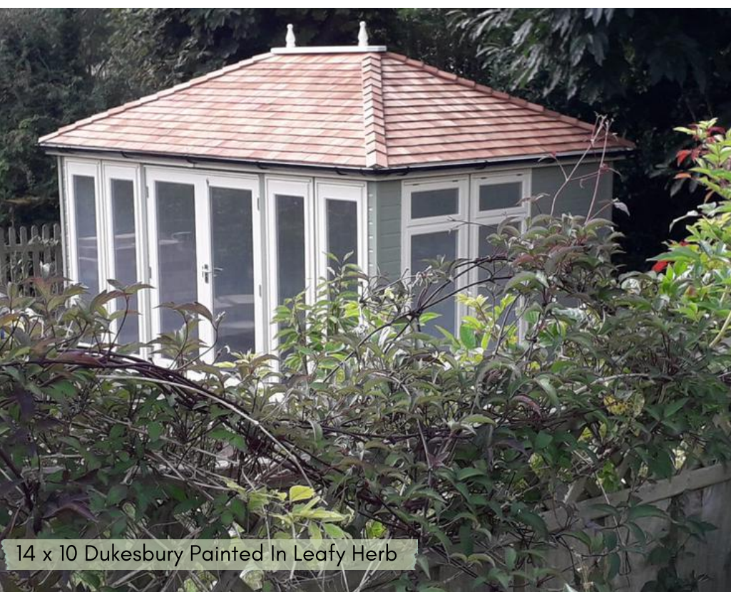
14 x 10 Dukesbury Painted In Leafy Herb