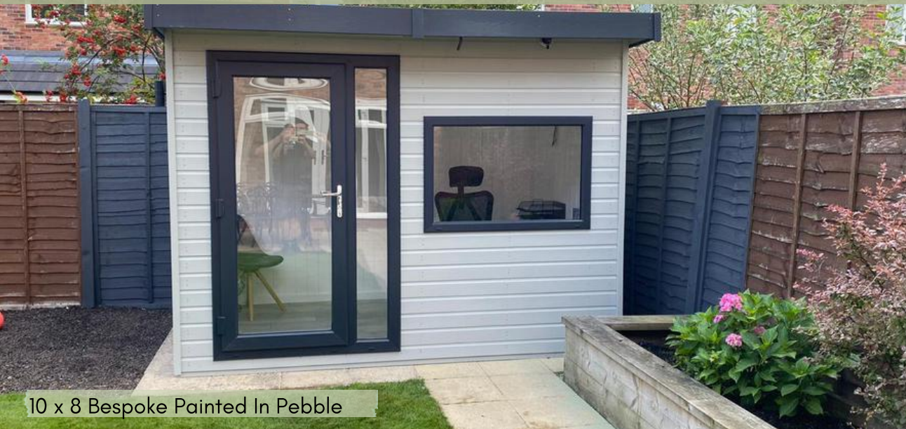
10 x 8 Bespoke Painted In Pebble

We like to offer our customers different options, so each garden room is beautifully bespoke to you. We listen to your needs and develop a space that works for your exact requirements, you are not limited to the buildings shown in our brochure. Consider every detail of your new garden room by exploring the roof, doors and windows, cladding, colours, and internal flooring.