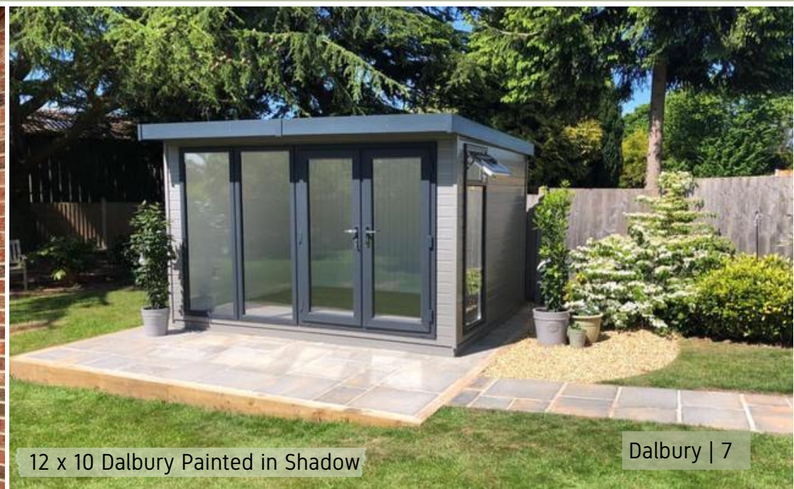
12 x 10 Dalbury Painted in Shadow