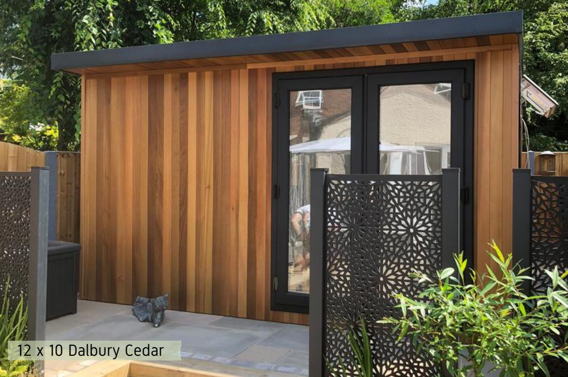
12 x 10 Dalbury Cedar