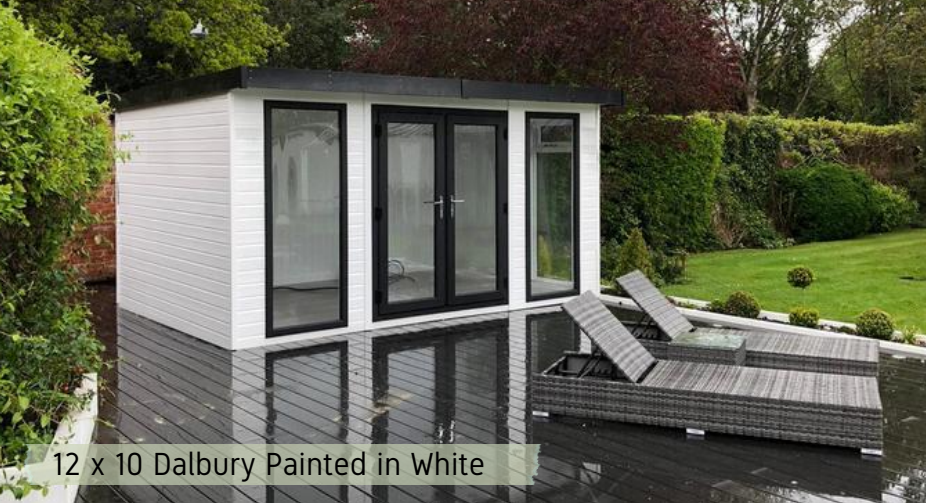
12 x 10 Dalbury Painted in White