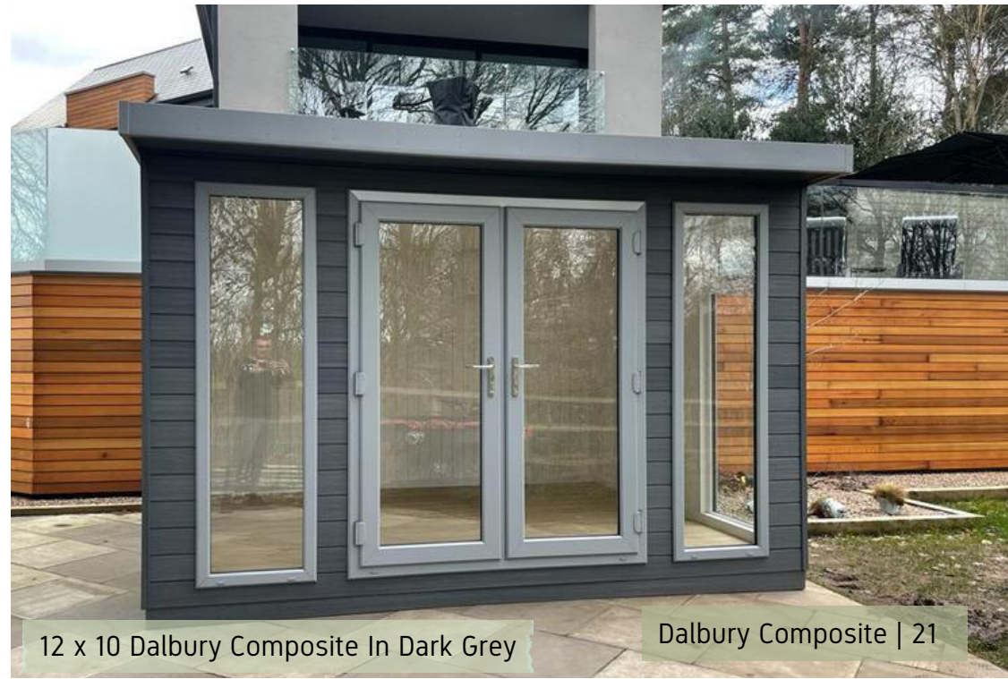
12 x 10 Dalbury Composite In Dark Grey