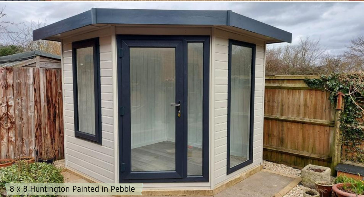
8 x 8 Huntington Painted in Pebble