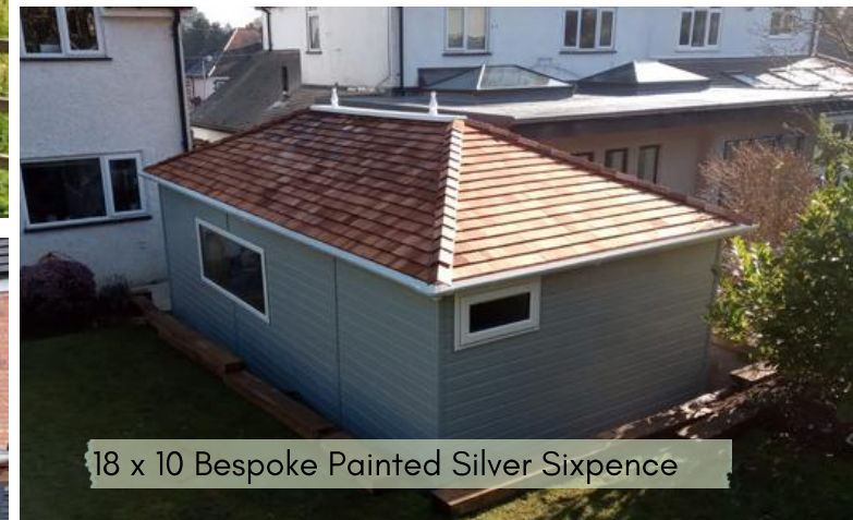
18 x 10 Bespoke Painted Silver Sixpence