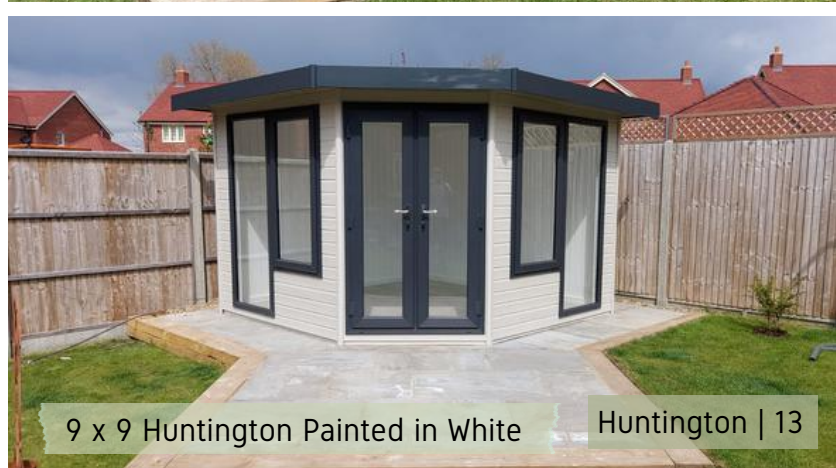
9 x 9 Huntington Painted in White