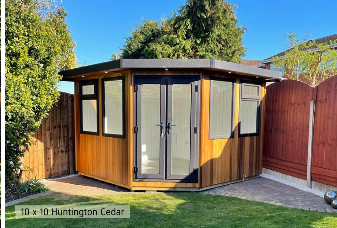
10 x 10 Huntington Cedar