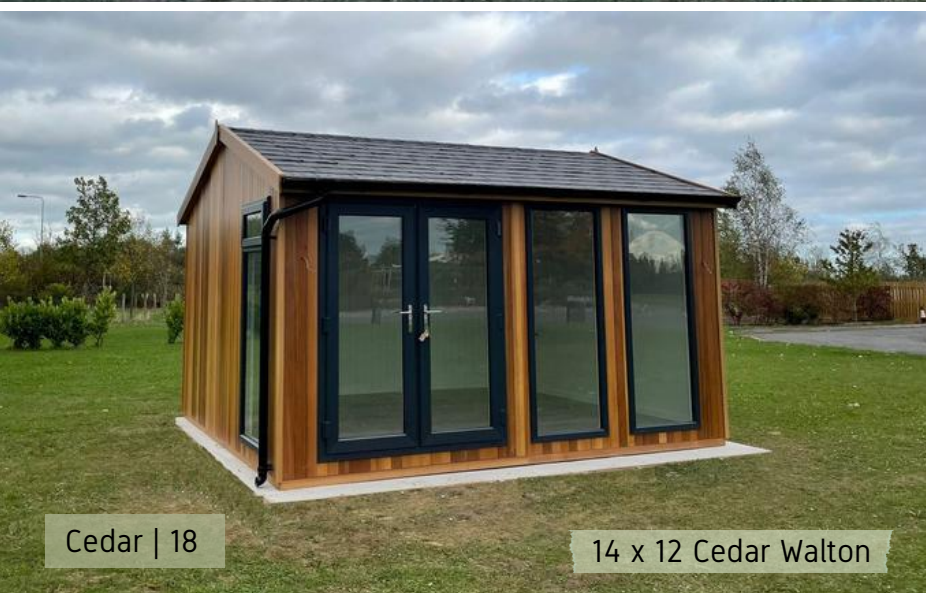
Cedar | 18