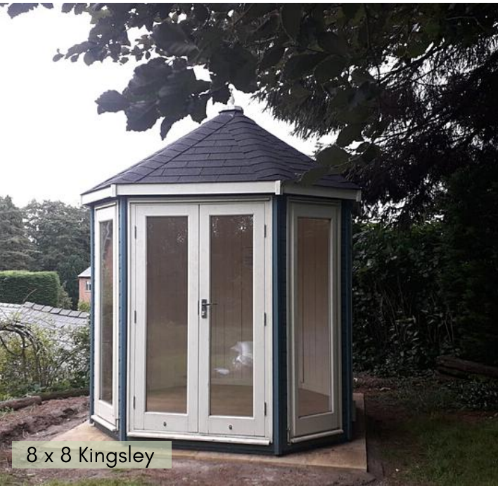
8 x 8 Kingsley

The eye-catching octagonal design of the Kingsley is a delightful addition, creating a focal point in any garden. Create a pleasant sanctuary in your garden where you can truly unwind.