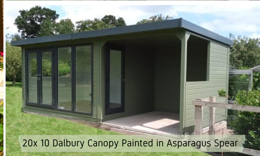
20x 10 Dalbury Canopy Painted in Asparagus Spear