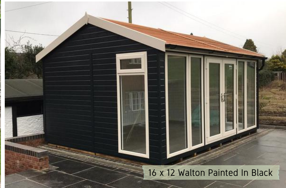
16 x 12 Walton Painted In Black