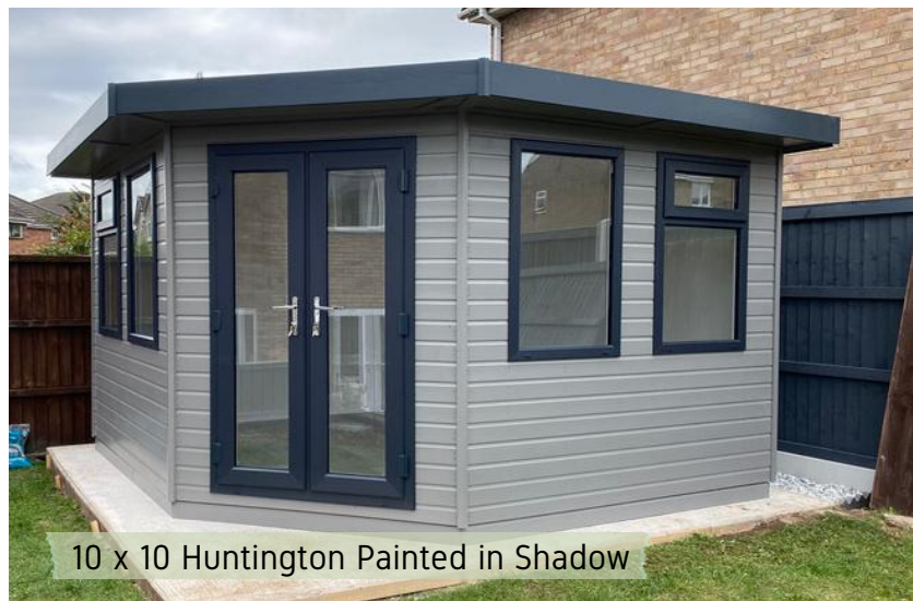
10 x 10 Huntington Painted in Shadow