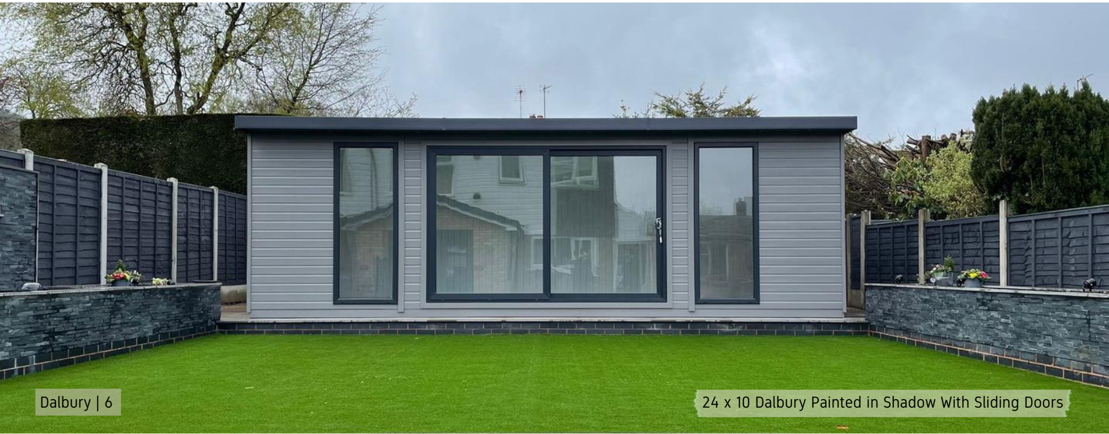
Dalbury | 6