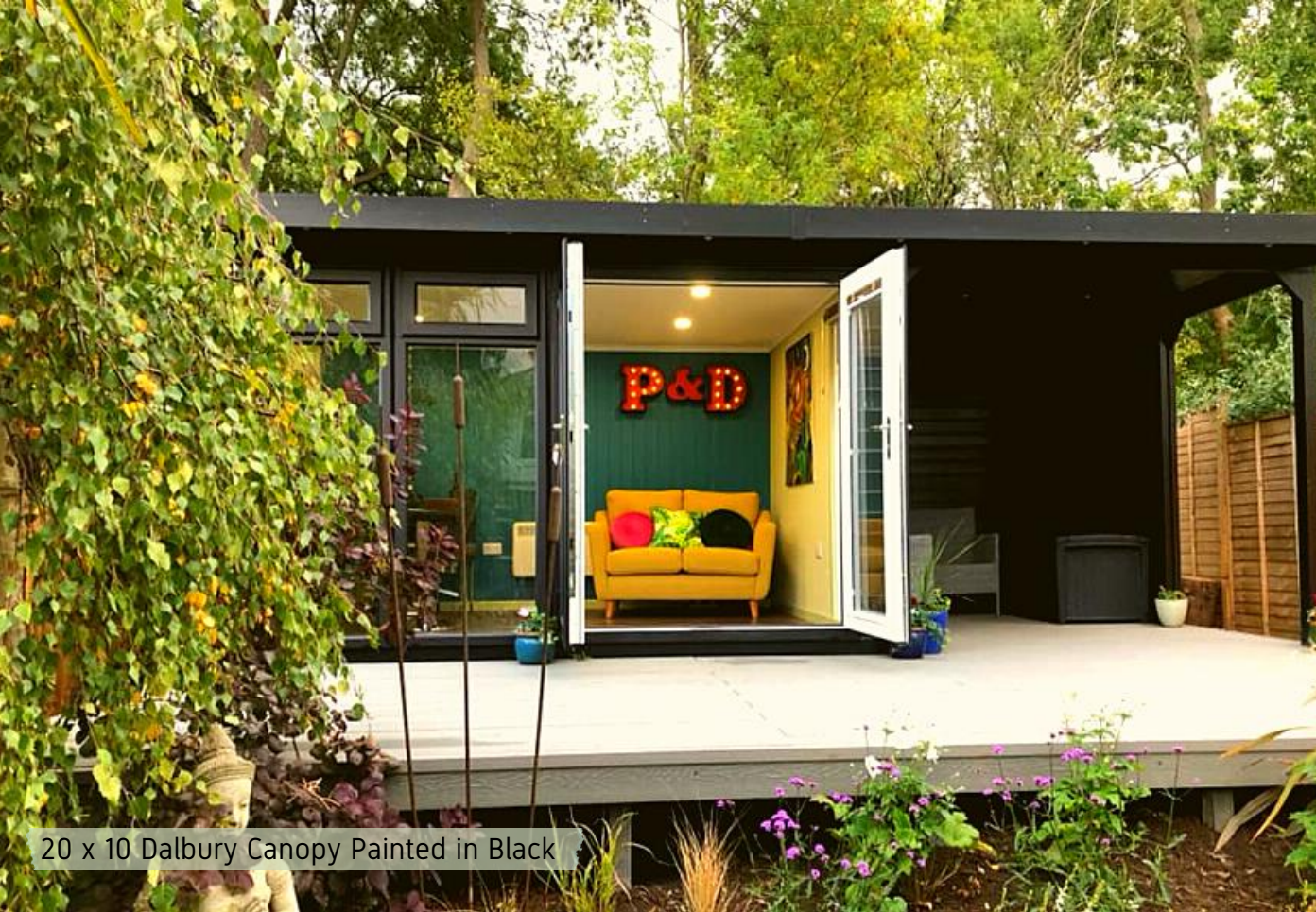
20 x 10 Dalbury Canopy Painted in Black