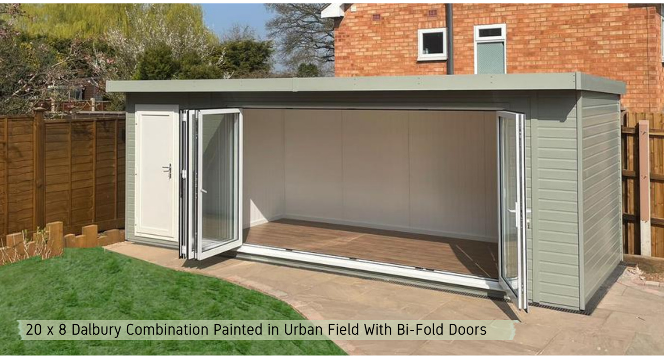
20 x 8 Dalbury Combination Painted in Urban Field With Bi-Fold Doors