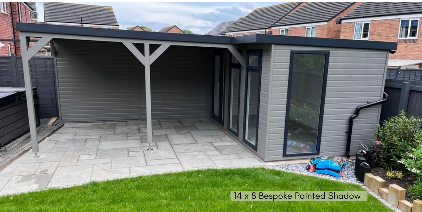
14 x 8 Bespoke Painted Shadow