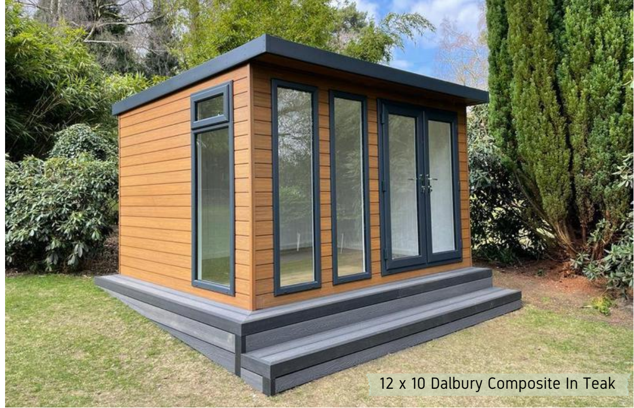
12 x 10 Dalbury Composite In Teak

Our superior quality composite cladding has been specially selected for our garden rooms. The composite collection boasts a robust design whilst replicating the timeless characteristics of natural timber. We have heavily invested in international imports to source the finest composite; which enables us to keep the building cost low. Our environmentally conscious design uses 95% ethically sourced materials which provides a harmonious solution to maintenance-free outdoor living.