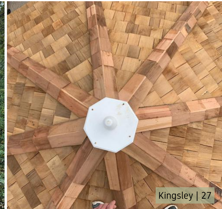
Kingsley | 27