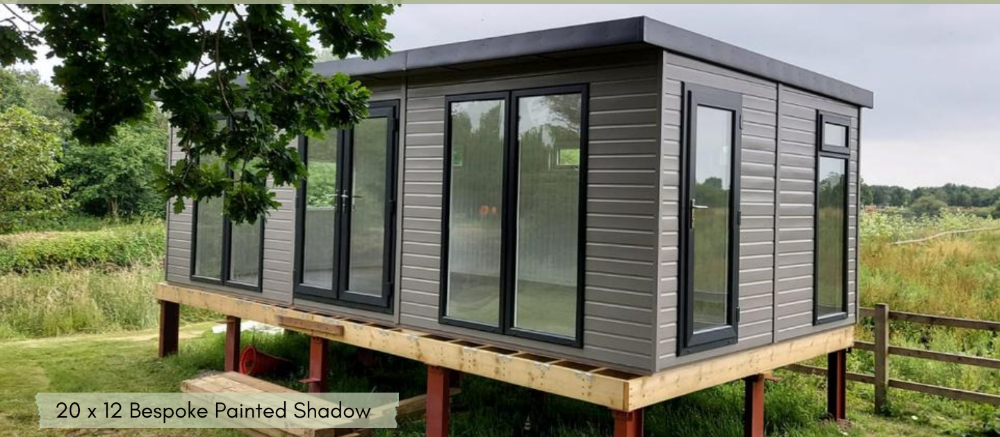
20 x 12 Bespoke Painted Shadow