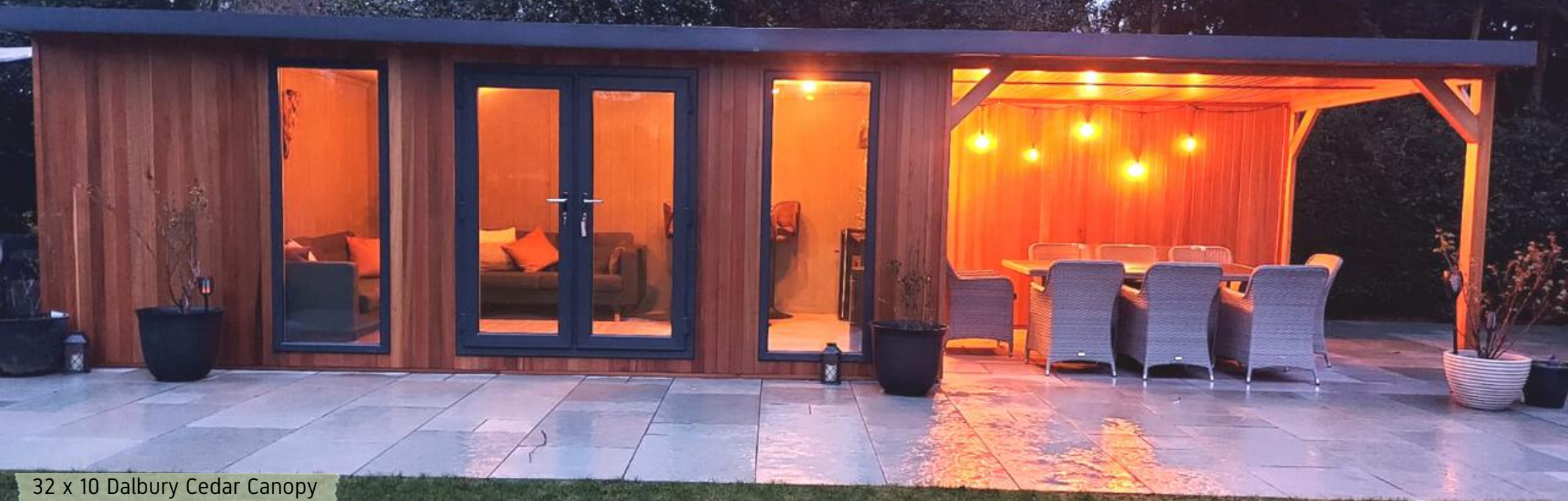
32 x 10 Dalbury Cedar Canopy