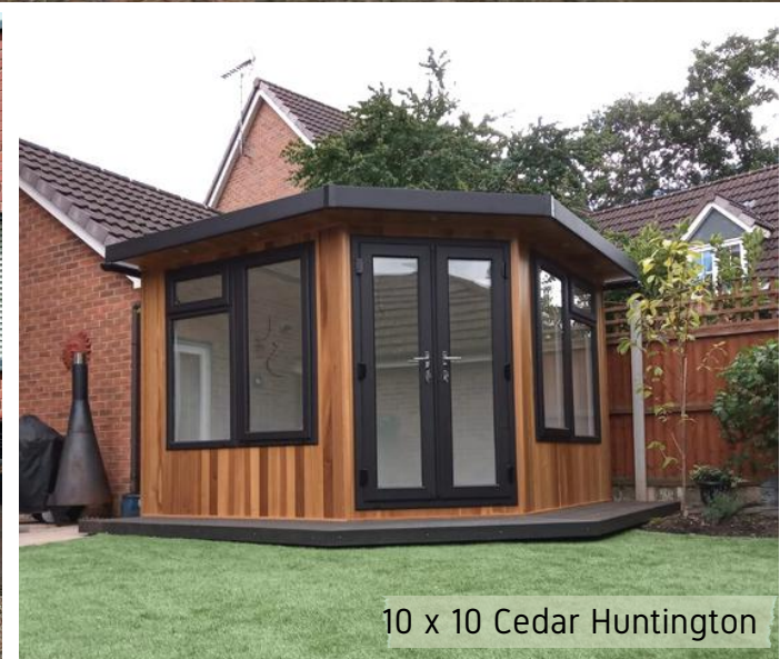
10 x 10 Cedar Huntington