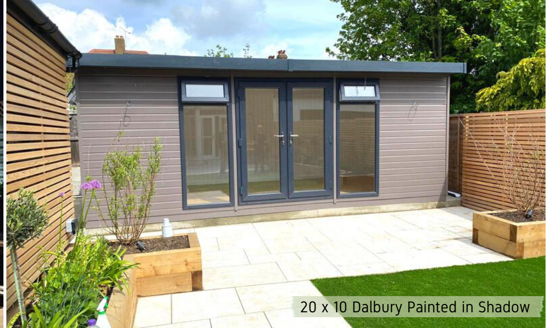
20 x 10 Dalbury Painted in Shadow