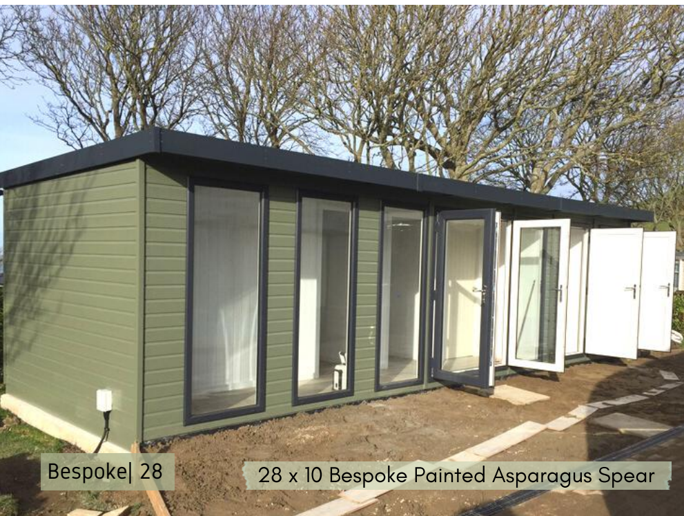
Bespoke | 28