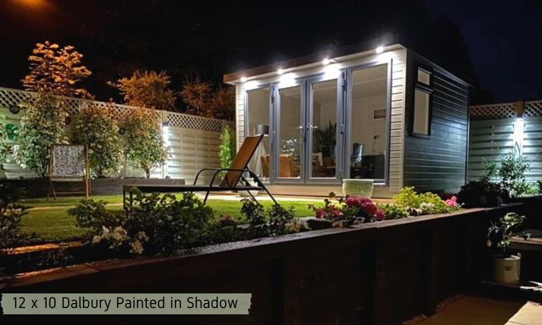
12 x 10 Dalbury Painted in Shadow