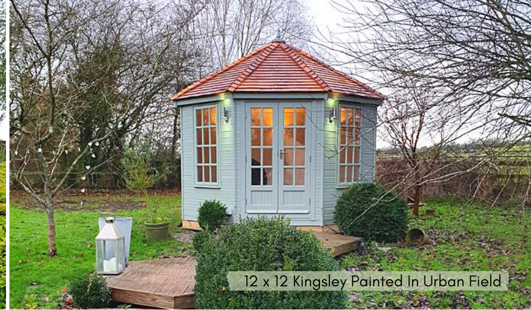
12 x 12 Kingsley Painted In Urban Field