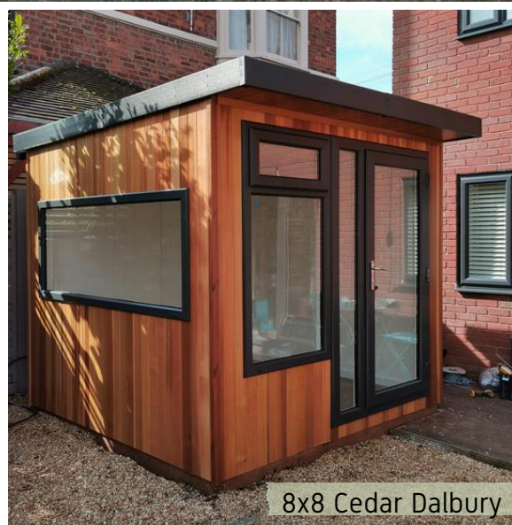
8x8 Cedar Dalbury