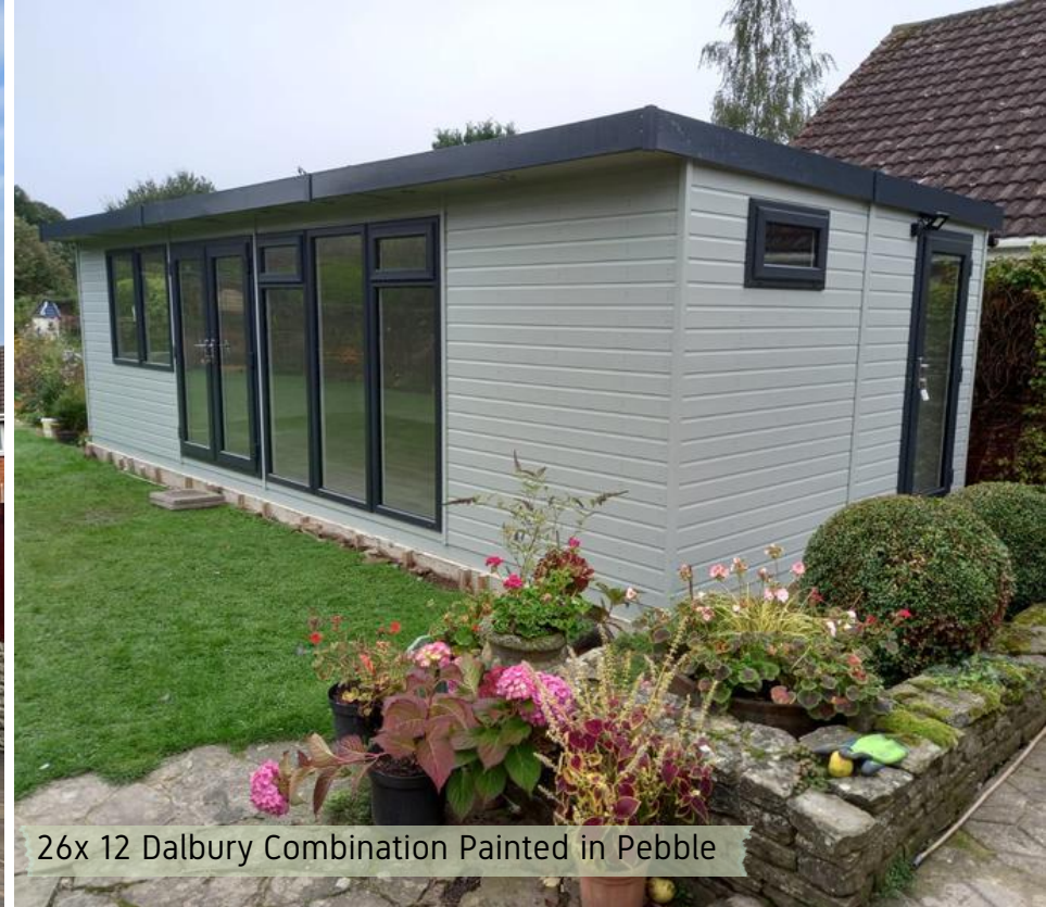
26x 12 Dalbury Combination Painted in Pebble