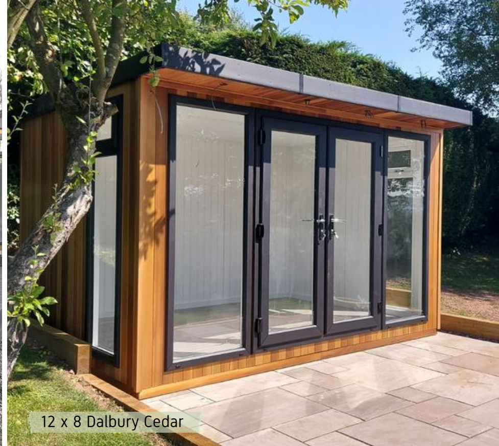
12 x 8 Dalbury Cedar