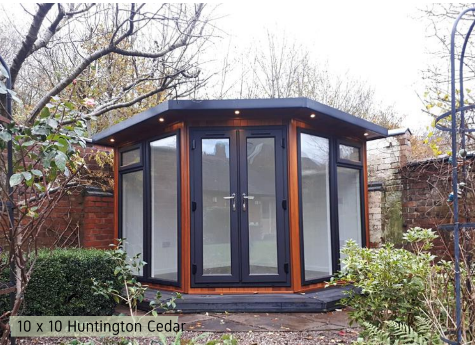
10 x 10 Huntington Cedar