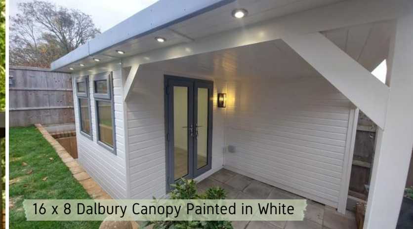
16 x 8 Dalbury Canopy Painted in White