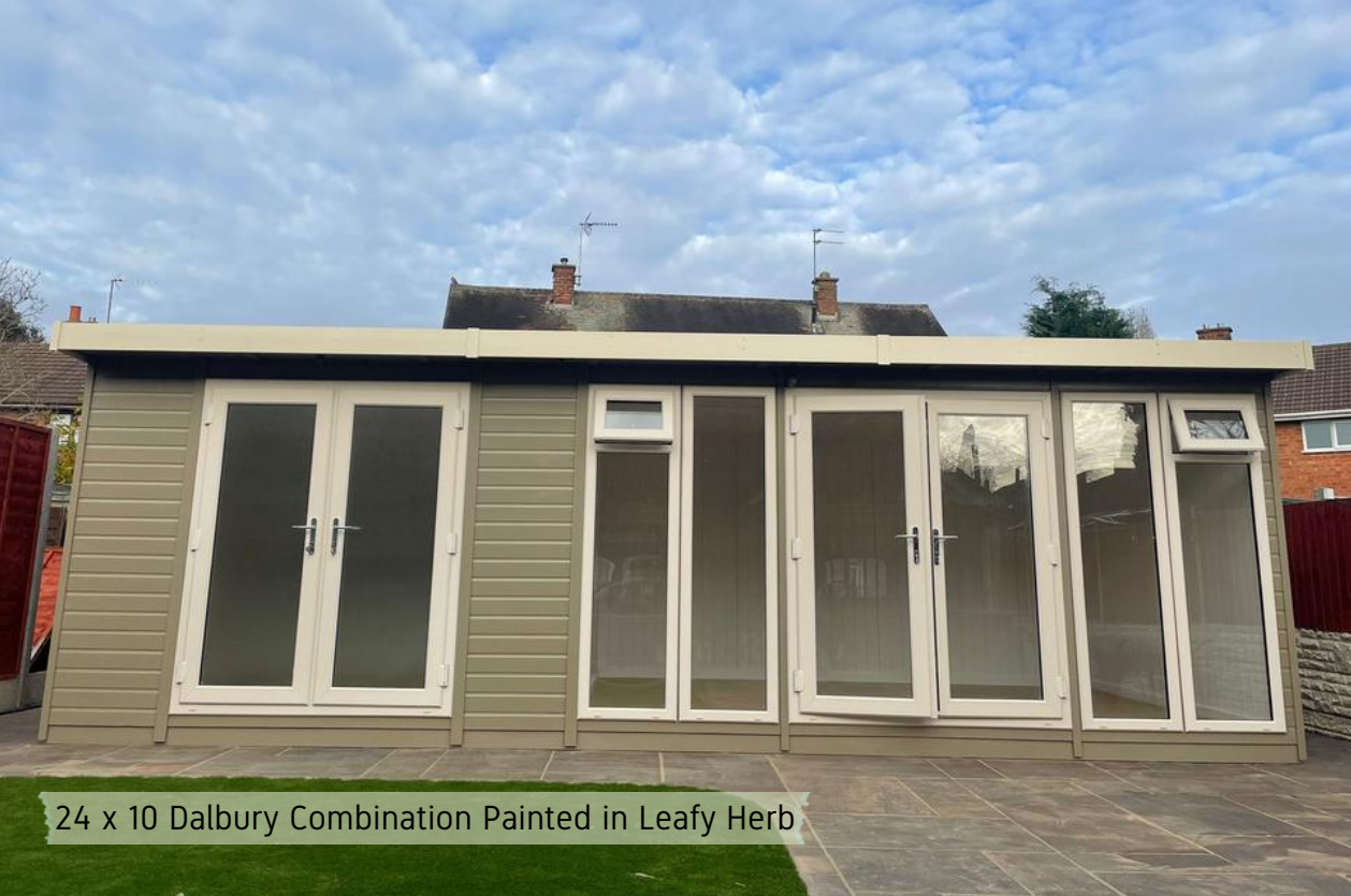
24 x 10 Dalbury Combination Painted in Leafy Herb