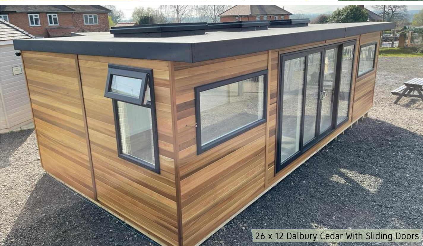
26 x 12 Dalbury Cedar With Sliding Doors