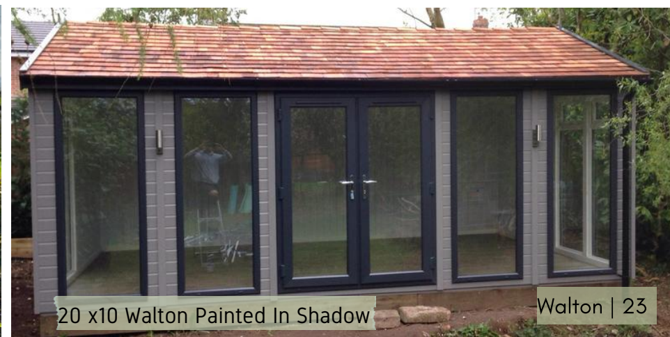
20 x 10 Walton Painted In Shadow