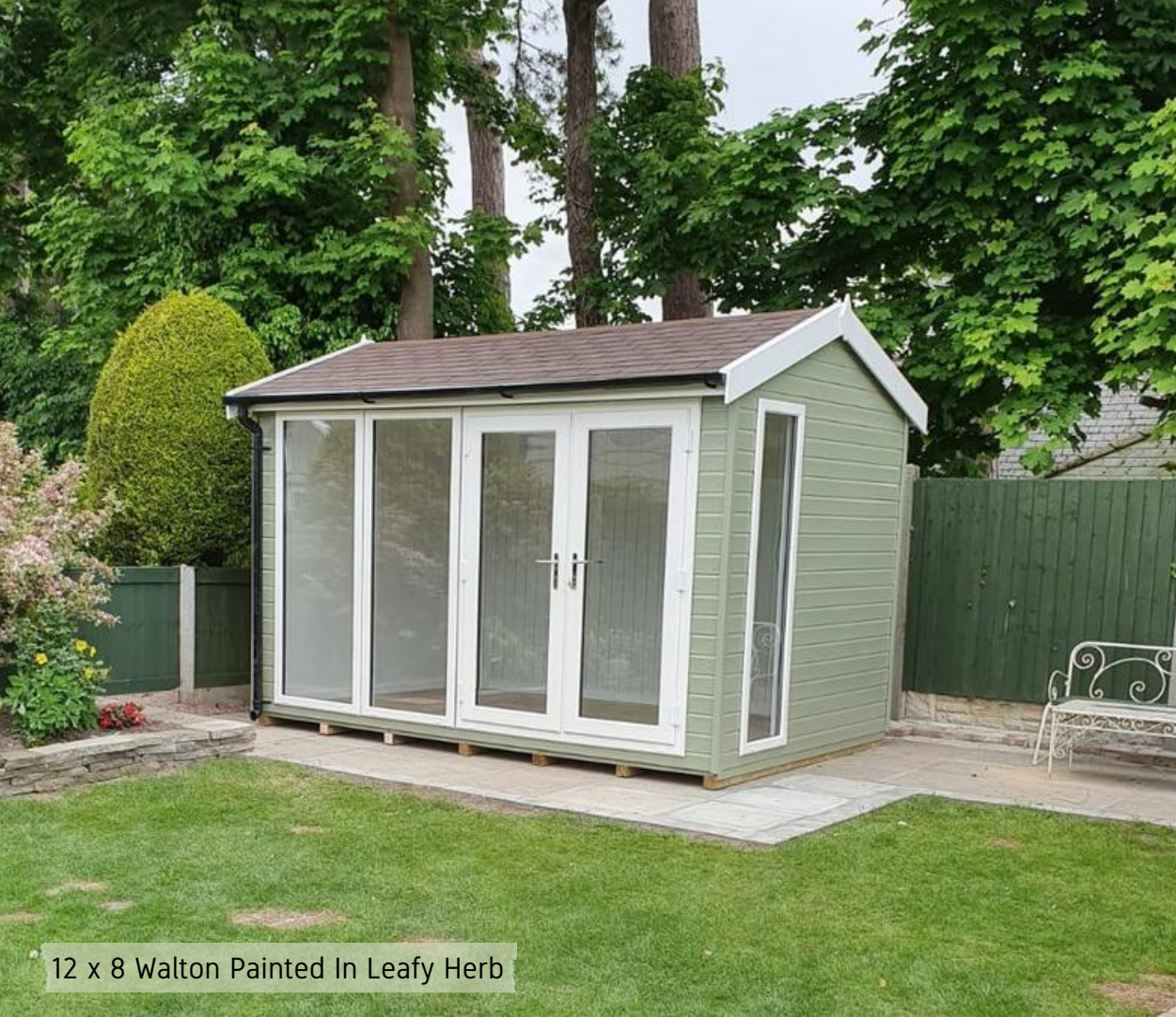
12 x 8 Walton Painted In Leafy Herb

The clean lines of the apex roof and vaulted ceiling offers a more elevated and light interior. The classic style of the Walton offers a grandeur space creating endless possibilities.