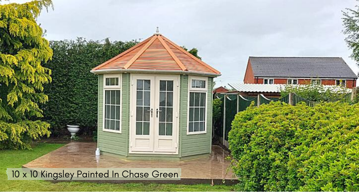
10 x 10 Kingsley Painted In Chase Green