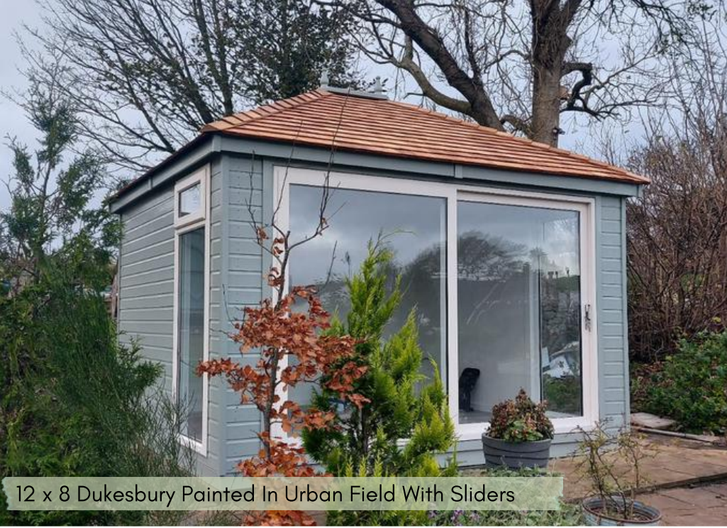
12 x 8 Dukesbury Painted In Urban Field With Sliders

The much loved Dukesbury is a classical-shaped building with an elegant hipped roof adding tasteful character to any garden. Make it your own by choosing from a variety of roof finishes to create the perfect outdoor retreat.