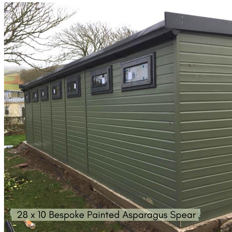
28 x 10 Bespoke Painted Asparagus Spear