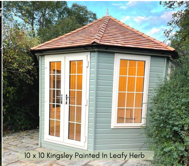
10 x 10 Kingsley Painted In Leafy Herb