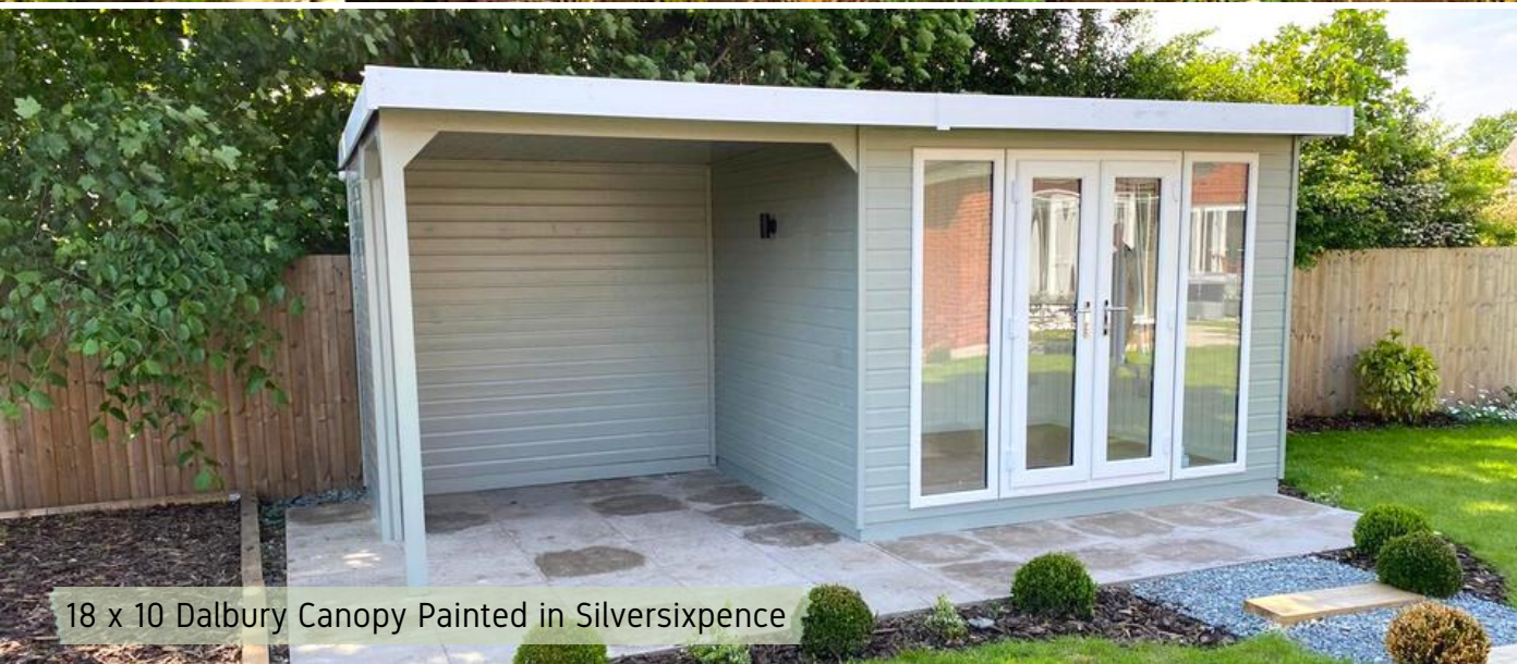
18 x 10 Dalbury Canopy Painted in Silversixpence