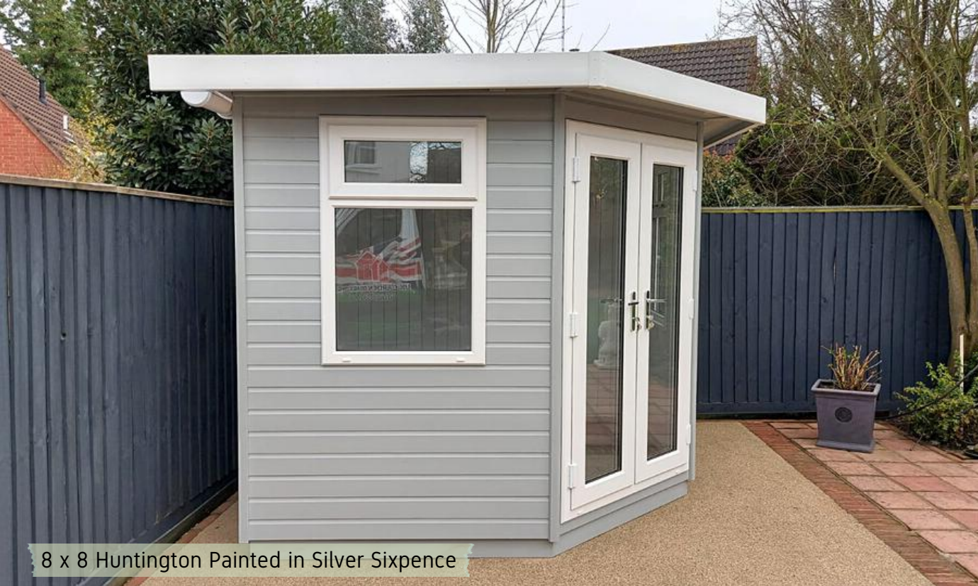
8 x 8 Huntington Painted in Silver Sixpence

The Huntington nestles perfectly into a garden of any size or shape. The contemporary design utilises the space available whilst, adding a valuable dimension to your garden.